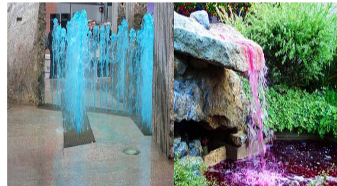
Fountains, Water Features Ponds & Aquariums