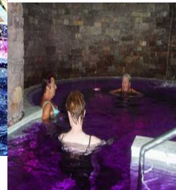
Swimming Pools, Spas & Hot tubs